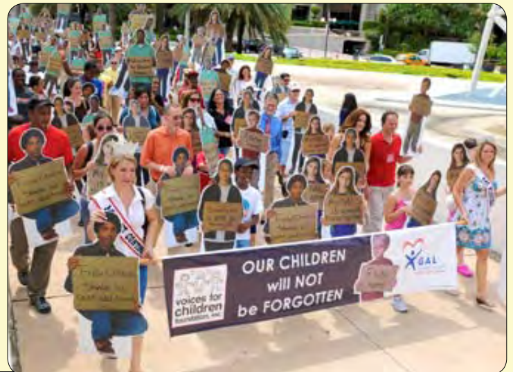
The Miami Forgotten Children march

The 11 th Judicial Circuit Guardian Ad Litem Program brought National CASA's Forgotten Children campaign to Miami-Dade County on September 12. The event was hosted by the program's nonprofit arm, the Voices for Children Foundation. The Forgotten Children campaign was designed to increase awareness about the need for all abused and