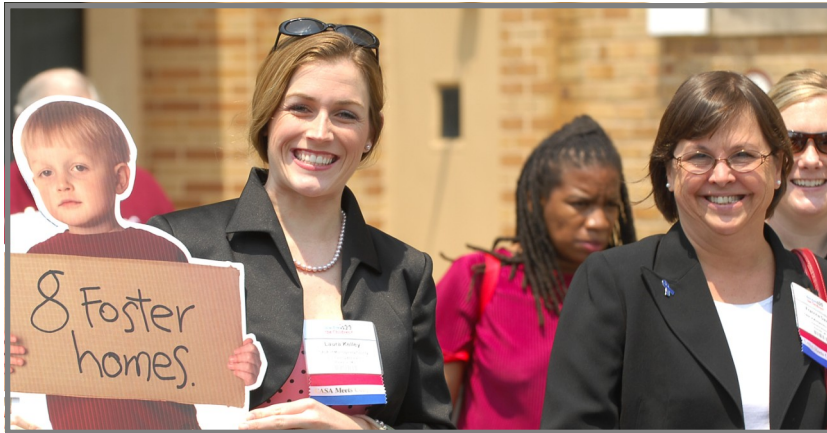
2008 CASA Meets Congress Attendees