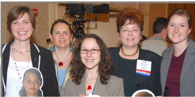
2008 CASA Meets Congress Attendees

Every four years, the CASA network has an opportunity to visit their elected officials on Capitol Hill. CASA Meets Congress will occur in conjunction with the 2012 Annual CASA Conference on June 12, 2012. Over 600 CASA and GAL volunteers, program staff, judges, child advocates and other supporters will share CASA's message with our national leaders.