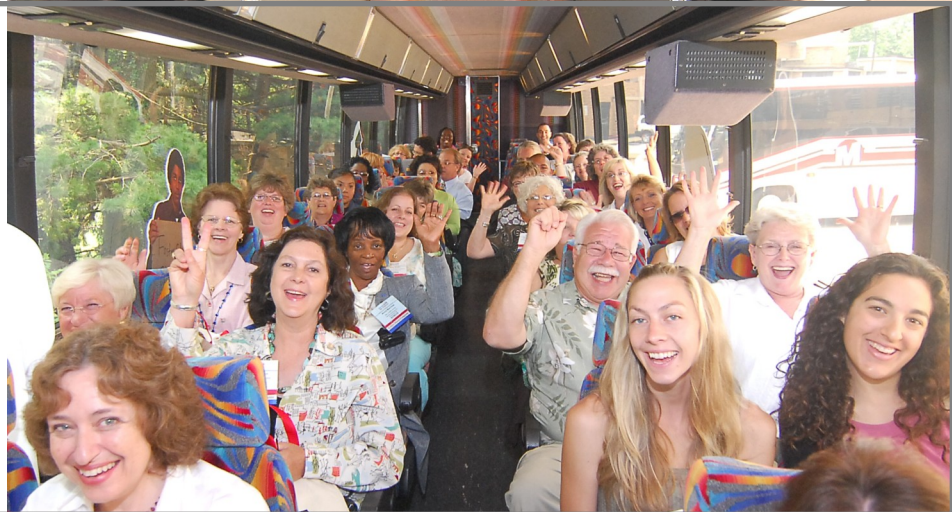
Excited attendees on their way to Capitol Hill