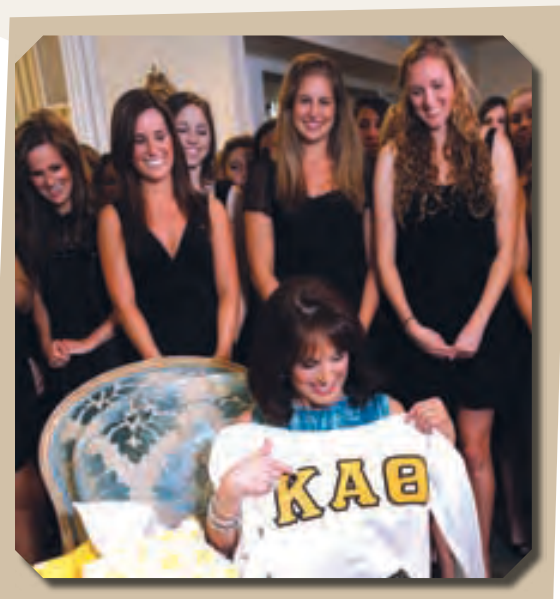
In an initiation ceremony at Kappa Alpha Theta's Omicron chapter at the University of Southern California, Theta women welcomed Robin McGraw and celebrated their shared commitment to giving a voice to abused and neglected children.